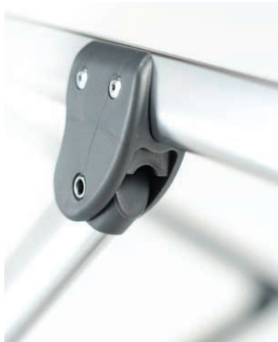
HIGH IMPACT POLYMER JOINTS AND EXTRUDED ALUMINUM RIBS