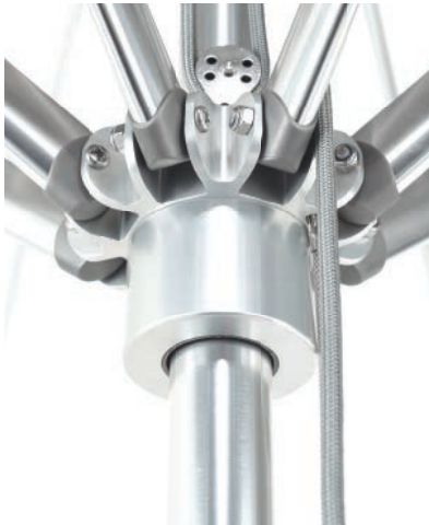
POLISHED SILVER ANODIZED ALUMINUM FINISH