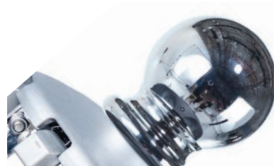
Optional: CLASSIC BALL FINIAL