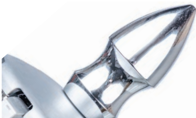
Standard: VERTEX FINIAL