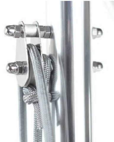
COMMERCIAL PULLEY SYSTEM